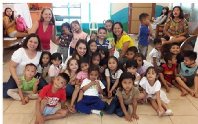
Our STEPS students say "Hello"